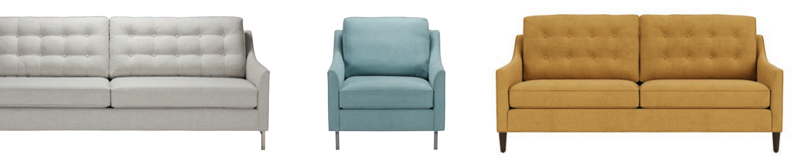
DIONDRE, DYANNA & DEVERELLE: DIVINE DESIGN DETAILS