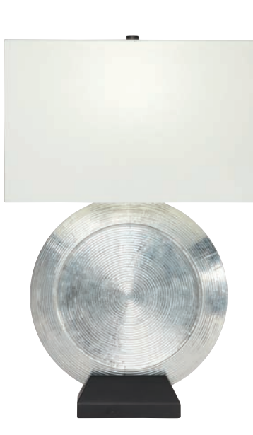
KATNI TABLE LAMP 096037