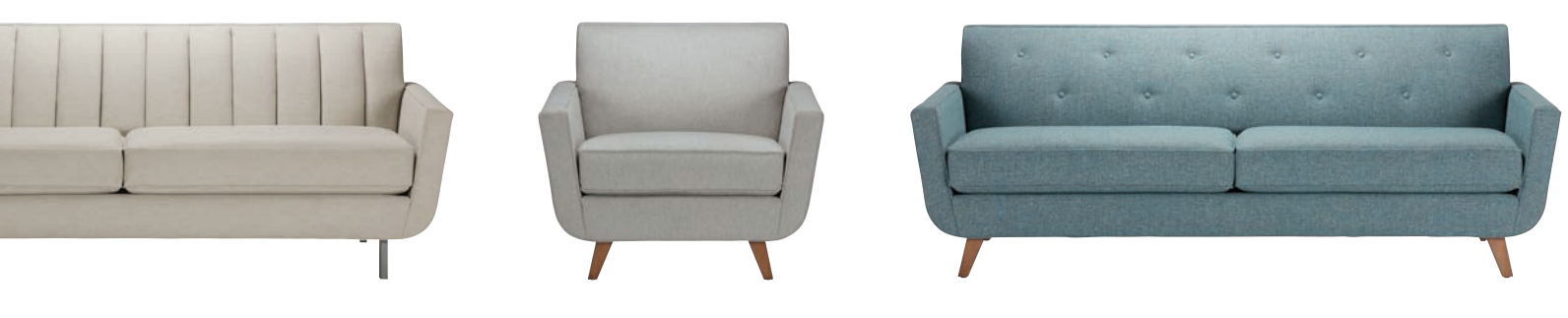
RORY, RILEY & REMSON: RAVISHING RETRO REFRESH