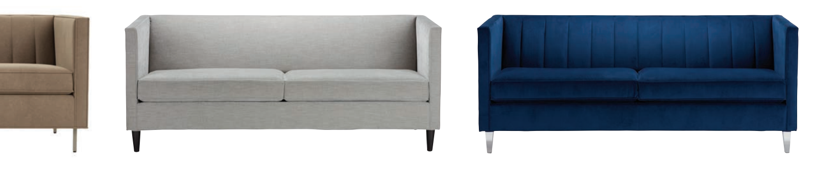
FRANCA, FIORELLO & FRANCA'S TWIN: FABULOUS FORMAL FLAIR