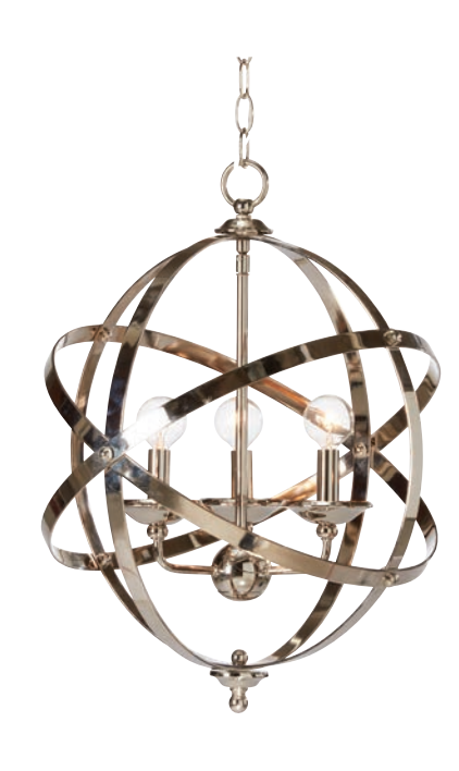
NAVESINK NICKEL PENDANT 093104