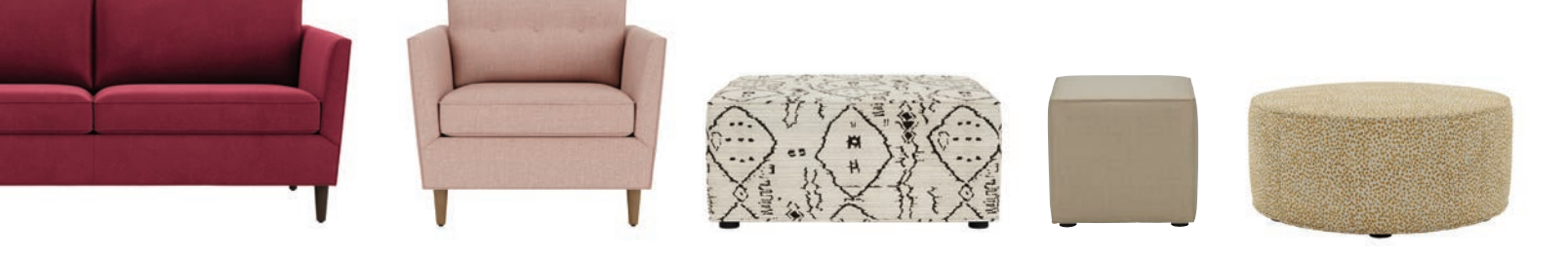
CARRAH, CORWYN, KEYNEN, KENDRICK & KARLEIGH: COOL CONTEMPORARY COMFORT